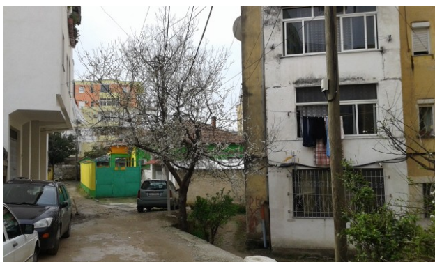
Në labirint të Qytetit Studentit