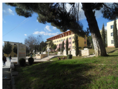
Zona e Finishit