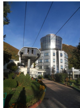
Dajti Tower Belvedere Hotel