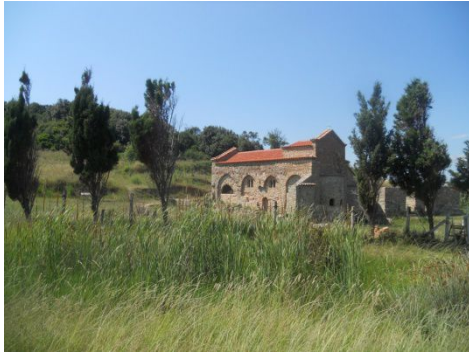
Medieval church St. Antony