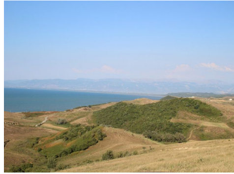
View from the terrain