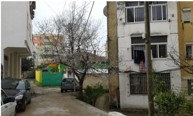
in the labyrinth of Qytetit Studentit